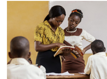
Teacher Education and Development