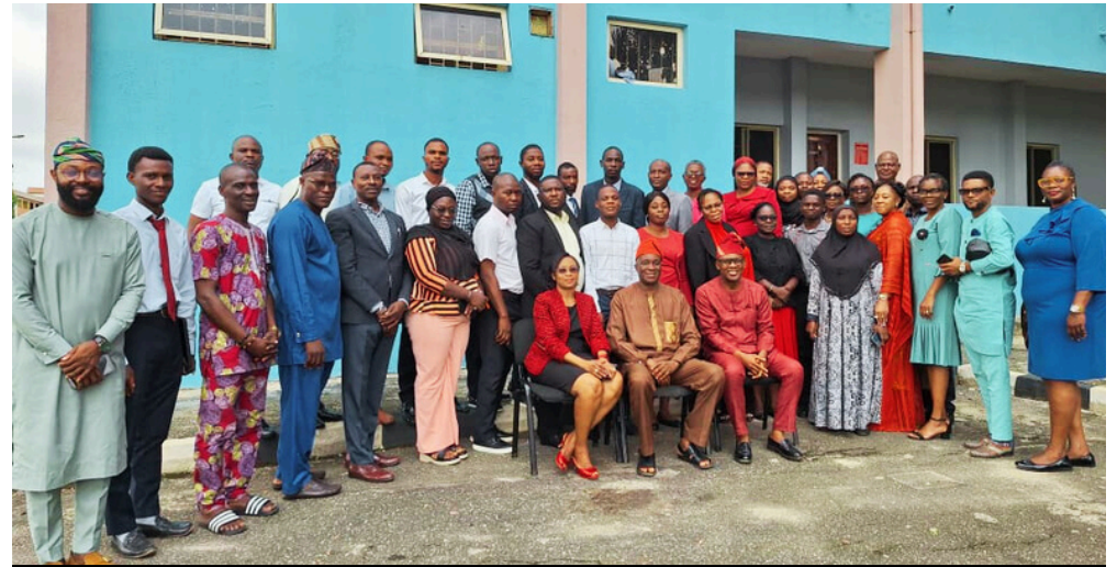
Digital Transformation Strategies in Public Administration Course for Lagos State Officers (GL 8-17), held from Tuesday, 1st to Thursday, 3rd July 2025, at PSSDC, Magodo.