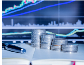
Finance & Economic Development