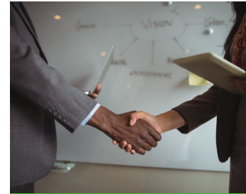
Human Resource Management