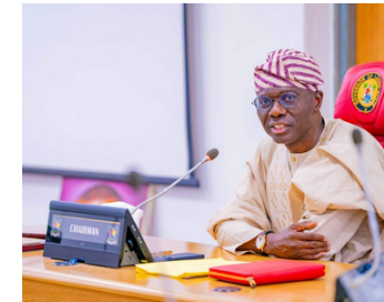
Public Sector Governance