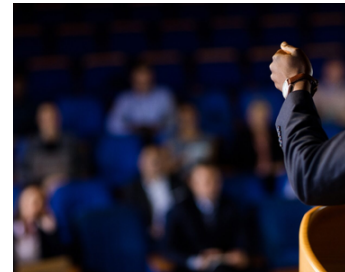
Modern Public Admin. & Management