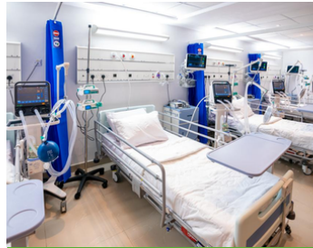
Health and Allied Matters