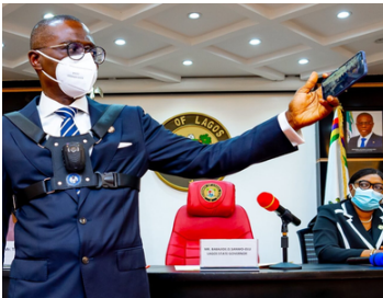
Local Govt. & Security Studies